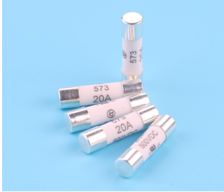
Dimensions (unit: mm)